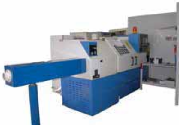
DEPS Ace Lathe.