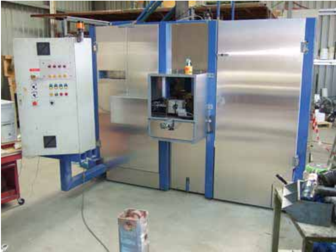
DEPS Specially designed automatic slotter

Well look! If you're customers are in the drilling, Civil or mining business and you want drilling or piping supplies that are top quality, guaranteed every time... and turn up when you need them most and your sick and tired of dealing with suppliers that let you down then your life just got a whole lot easier.